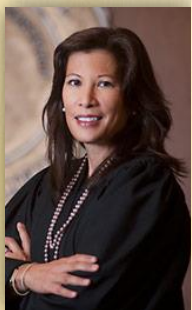
Tami Cantil-Sakuye, Chief Justice of California

“The bottom line is that the Law and Public Policy Academy is what you make of it. You get to choose. Your time in the LPPA will not be like anyone else’s at McClatchy. Wade in and choose your niche or just start connecting and let the ideas and opportunities come to you.”