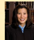
Tami Cantil-Sakuye, Chief Justice of California