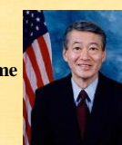
The Late Robert Matsui, U.S. Representative, 5 th Congressional District