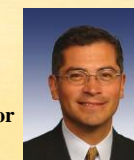
Xavier Beccerra, U.S. Representative, 31 st Congressional District